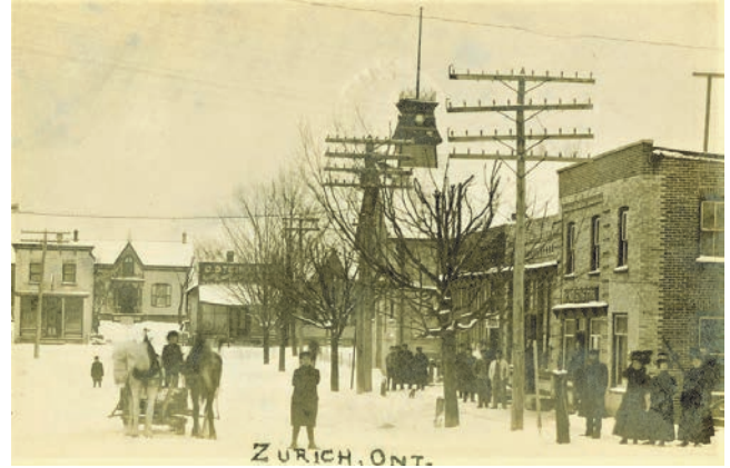
Namesake Puzzles Inspiration: Early Days in Zurich, Ontario.

4 I've just received a listserve notification (you know, those early-day electronic mailing lists), informing me that very, very, very late in the year, this village in western Switzerland is in a rather celebratory mood. Drop the first half of its two-part name, typically abbreviated anyway, to infer the Canadian namesake. Canada has two lakes with that same name - one in Saskatchewan, one in Ontario. Can you name them?