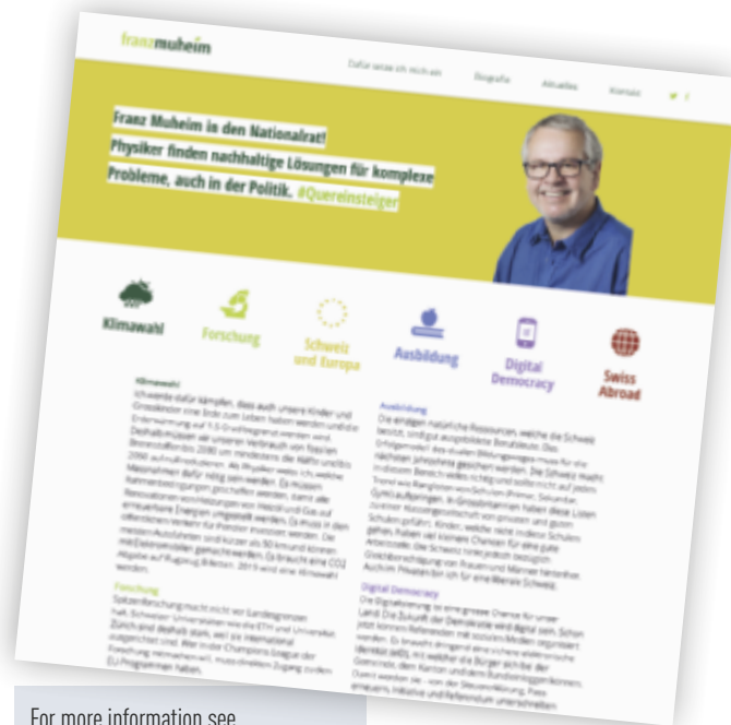
For more information see www.franzmuheim.ch

I encourage the Swiss Abroad to vote in this election and to make our voice count. For this the Swiss Abroad need a direct representation in the National Council. Furthermore, to solve the immense challenges of the future of Switzerland and the planet we live on, we will need politicians from all parties working together. As a non-career politician and Swiss Abroad I can bring the view from the outside and my professional experience as a scientist to the table. Physicists find solutions to complex problems – also in politics.'