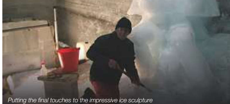
Putting the final touches to the impressive ice sculpture