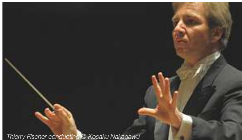
Thierry Fischer conducting

TF: Yes absolutely. You can do wild things in America as well. At the BBC I was able to do fantastic programming, which no other organisation would have permitted. We did the Dutilleux festival, huge projects like Messaien's "Transfiguration", the complete Oratorios by Berlioz, and a series of commissions by Paul Sacher. The BBC had both the capacity and the necessity, being a Public Radio orchestra, for us to do that. In America, it's very different, everything is of course possible, as long as you manage to get public support!