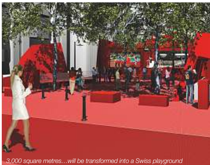
3,000 square metres...will be transformed into a Swiss playground

This special day will also mark the 100th anniversary of the construction of the Jungfrau Railway. There will be