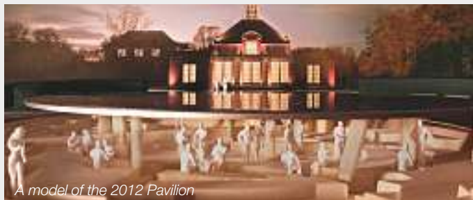
A model of the 2012 Pavilion

The Pavilion is Herzog & de Meuron and Ai Weiwei's first collaborative built structure in the UK and is open to the public until 14 th October. A major exhibition of the work of Yoko Ono can also be seen there.