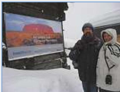
Contrast in Bellwald (VS).